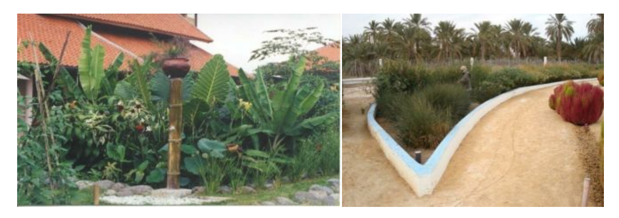
Figure 6. WWG systems: (left): Kuta/Leggian Bali, Indonesia; (right) Temacine, Algeria.

The WWG systems produced extremely good wastewater treatment without the use of imported technology or chemicals. The biodiverse systems grew luxuriantly and added to the landscape beauty where they were installed. The treated water was used for further greening through subsoil irrigation.